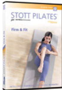
Firm & Fit